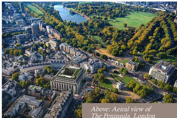
Above: Aerial view of The Peninsula, London Below: The Peninsula Hotel

The opening of the Peninsula Hotel, scheduled for 2022, will be an opportunity for residents to enjoy this valuable addition to our social venues. It is noticeable from their message to our residents – here included – that the hotel management is placing great emphasis on their desire to blend in, support and complement our community. We look forward to their opening to the public.