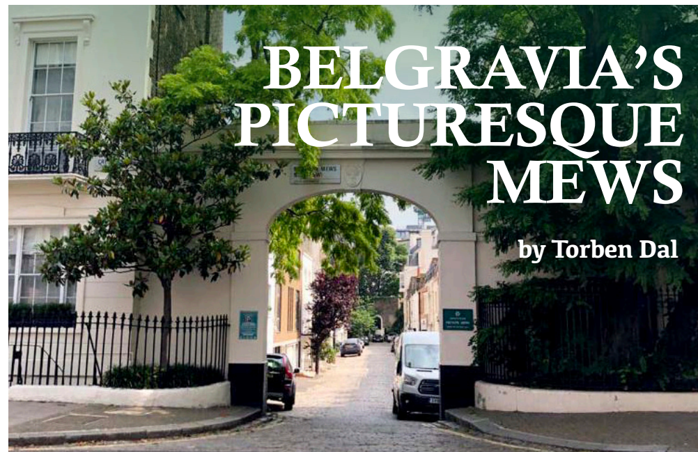
Above: Arched entrance to a London Mews Below: Boscobel Place

The BRA has a long-held interest in the upkeep of Belgravia's picturesque mews, having taken part in conversations with Grosvenor from the initial feasibility assessment works for the refurbishment of Boscobel Place, as the start of a potential mews-wide refurbishment to be implemented by Grosvenor.